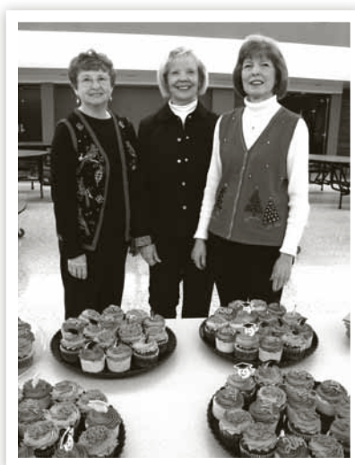
Alumni members welcome new graduates.

were welcomed as alums at a reception sponsored by the Aultman College Alumni Association. Graduates, friends and family enjoyed cupcakes and beverages while celebrating the happiness of the occasion. The December 2009 graduating class have already shown themselves to be dedicated Aultman College alums by raising $500 for the 1892 campaign and adding a leaf to the Giving Tree.