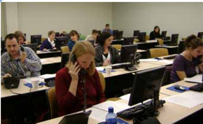
Aultman College students reached out to alumni to raise money for the 1892 Annual Campaign during the 2009 Alumni Phone-a-thon.