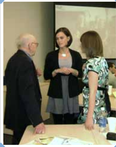
2010 Donor Appreciation Luncheon.