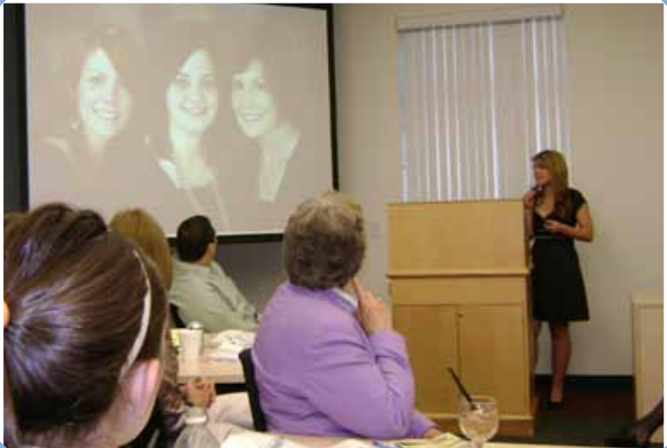
2010 Donor Appreciation Luncheon.