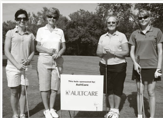
AultCare sponsored a team and a hole, along with providing a generous matching donation.