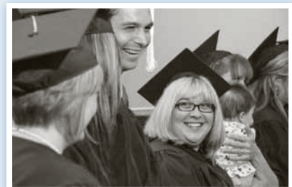
Graduates were all smiles as they were congratulated by family and friends.

Photos can be viewed at www.grandriverimaging.com . Enter your email address and Event Code: 90480-820