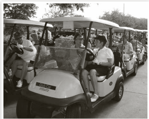
Twelve teams participated in the Aultman College Golf Outing, held at Wilkshire Golf Club.