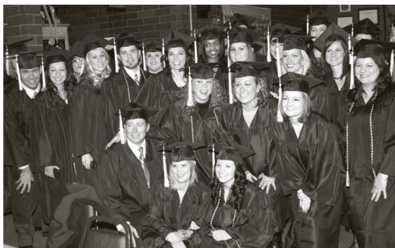
Graduates celebrate at a reception hosted by the Aultman College Alumni Association.