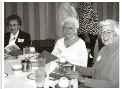
Alumni enjoyed good food, good entertainment and good company.